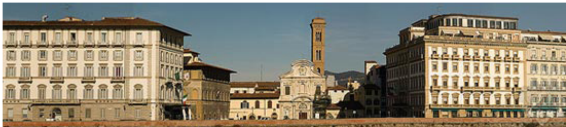
Present day foto - from left to right: Grand Hotel of Florence, French Institute , the church of Ognissanti and Hotel Excelsior